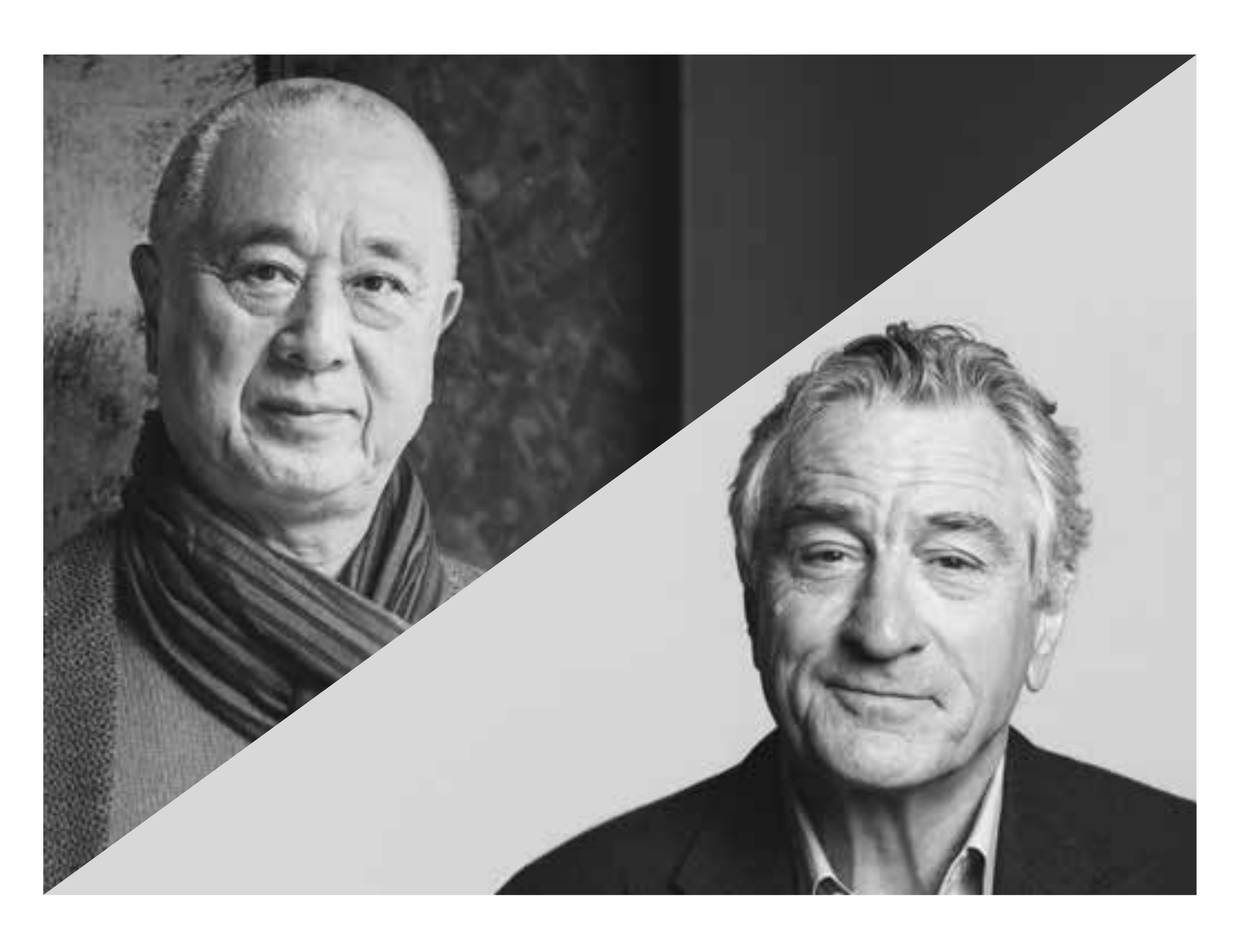
ARCHITECTS Ben Adams Architects, Ron Arad Associates DESIGN Studio Mica, Studio PCH ORIGINALS Robert De Niro, Nobu Matsuhisa ROOMS

Taken together, Nobu Hotel Shoreditch seems the perfect complement to its marvelously eclectic, brazenly original neighbors. Here, one discovers a culinary scene that is, quite simply, mindboggling—from gourmet hot dog stands to an Iranian-inspired Bombay café. The bars, which reveal themselves through hidden entrances, fall along the lines of upscale hangouts and password-protected speakeasies. Naturally, the shopping scene is comprised of both big names and those soon to be so, with high-end brands, indie labels, and eccentric gift shops all muddled together like fashion stars on a pulsing dance floor. In short, Nobu Hotel Shoreditch is sure to wow those who, like De Niro, are impressed by people who can do something really well.—